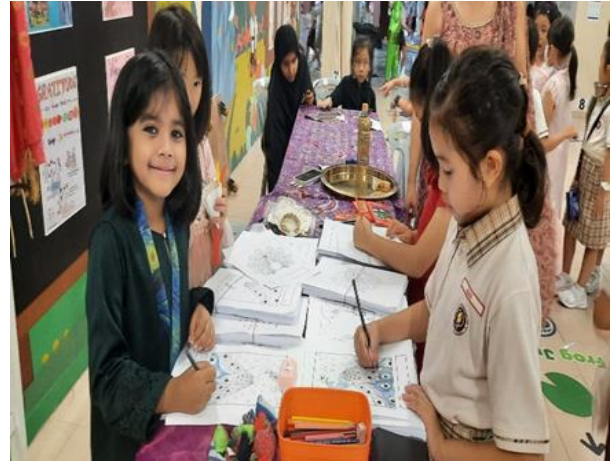
To know about the Indian art, 'Kolam'