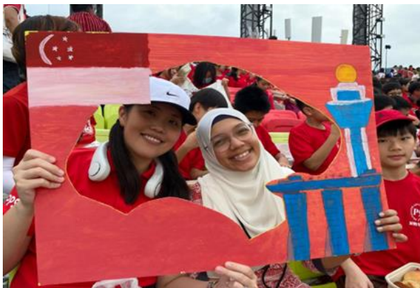
Teachers also joined in the fun