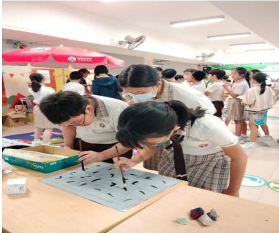
Students trying out the Chinese calligraphy

Racial Harmony Day was commemorated on 20 July 2023, Thursday. In the morning, the students watched a skit, titled “Ahh! Alien” in the Hall. The skit explored the issue of accepting differences. This year we also had booth activities for the students to learn more about the traditional practices, traditional games and crafts of the different races in Singapore. Through the activities, our students understand that Singapore is special because we learn from each other and celebrate our differences.