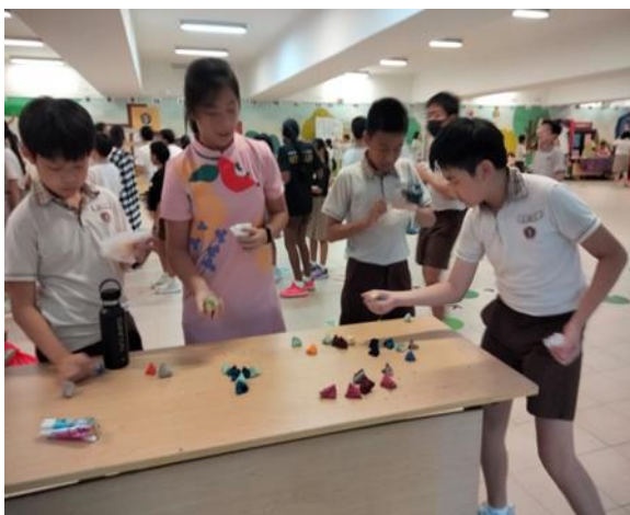
Playing the traditional game of 'five stones'