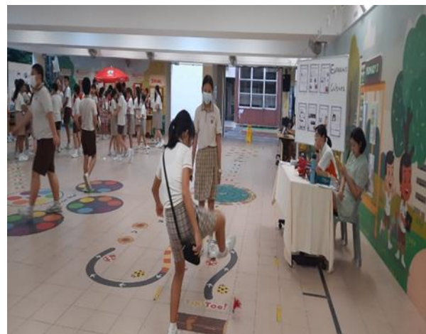
Learning how to play the chapteh