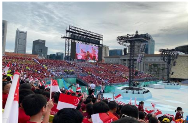
Good view of the Padang