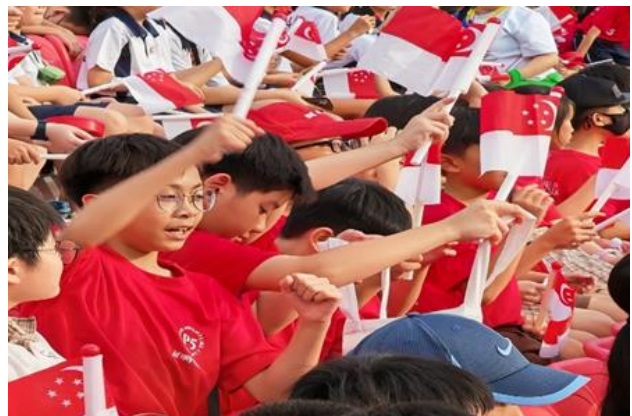
Waving the flags while singing the ND songs