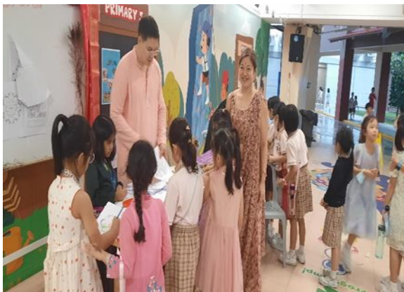
Parent Volunteers also came dressed in traditional costumes.