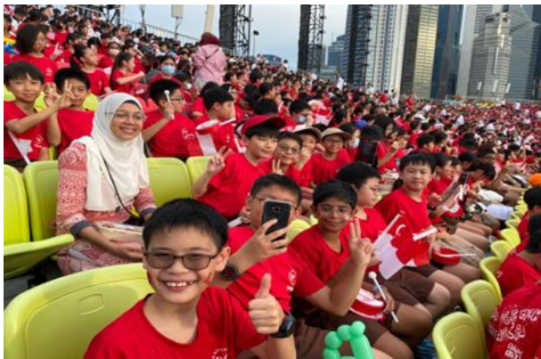
Ready to soak in the atmosphere

The grand finale was a mesmerising fireworks display, filling the night sky with a symphony of colours. The students stood in awe, symbolising the unity and resilience of our nation. The NE show provided a unique cohort experience, instilling patriotism and appreciation for our country.