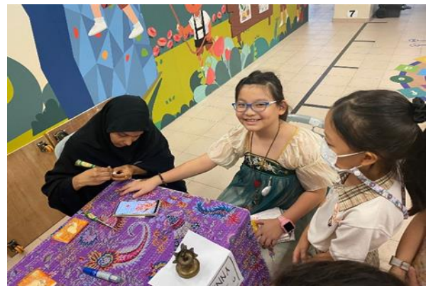
Henna drawing artist at the booth