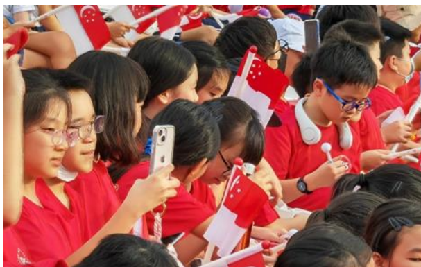
Capturing the moments on their phones