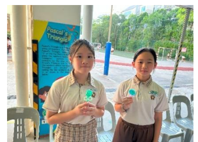
Our first attempt at making candies using pipe cleaners!