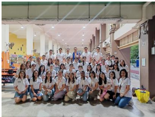
HPPA team – ever ready to support. We are stronger together