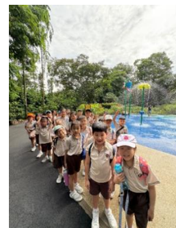
Having fun learning together as a class!