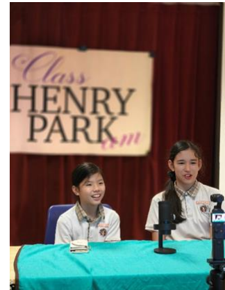
Live broadcast by newscasters from Henry Park Primary School