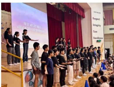
Prefectorial Board with a heartfelt rendition of "Count on Me"