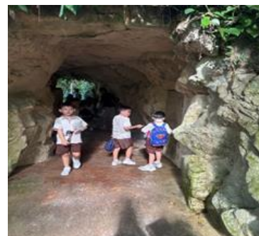
We came across a cave and waterfall!