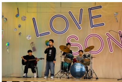
Band performance by our talented students