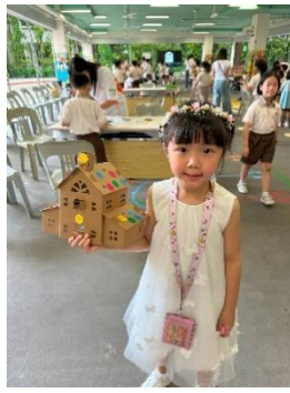
Wonders of cardboard