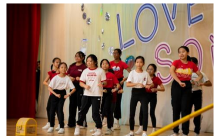
Dance CCA Performance