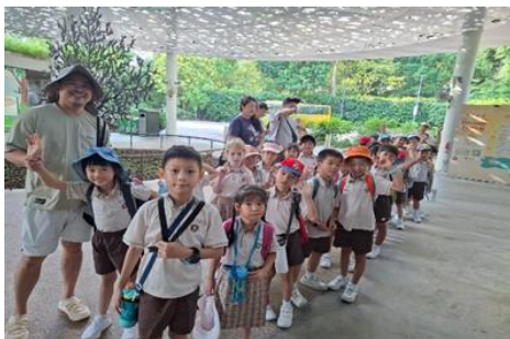
Ready for an exciting day of discovery!

We look forward to creating even more meaningful and memorable learning experiences in Term 4!