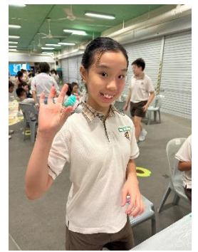
A keychain ornament uniquely designed by me!