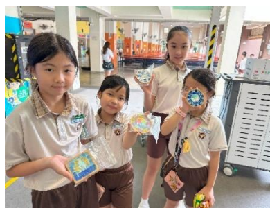
Proudly presenting our mosaic coasters!