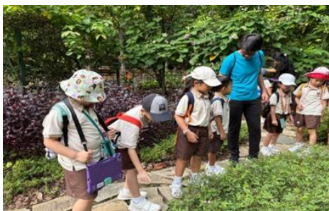
Looking for the mimosa plant. There it is!