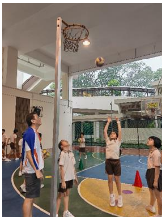
Looking up high to score our dreams and goals