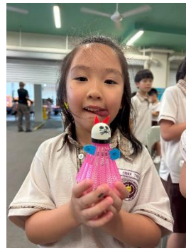
"Can you guess which animal this is?"