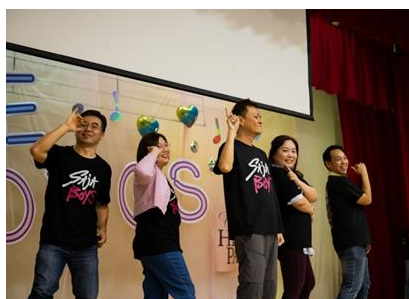
K-pop Dance by our enthusiastic HPPA