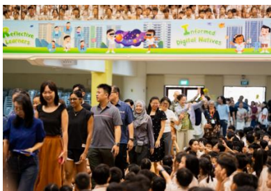
Grand entrance by our teachers

The celebrations concluded with intimate classroom-based activities featuring games and personal sharing sessions, allowing students to express appreciation directly to their teachers. Teachers' Day 2025 successfully blended fun, music, and heartfelt gratitude into an unforgettable celebration, reminding teachers of their lasting impact and the love and respect that surrounds them within the Henry Park family.