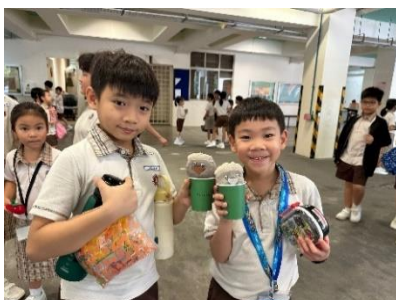
"Wonder what our grassheads will look like..."

Through our termly motg during SHINE Day, and with a focus on recyclable materials, students across all levels had the opportunity to explore and experiment with creative ways of repurposing everyday items. From growing their own grass, to reimagining the use of cardboard, to upcycling used shuttlecocks, they discovered the distinct characteristics of materials and how these materials can be reused with a sprinkle of imagination and tinkering. Along the way, students also began to reflect on how we can innovate within our means to work towards sustainability.