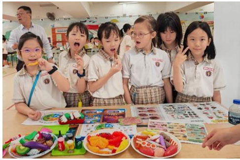
Eat Healthy – Be Happy