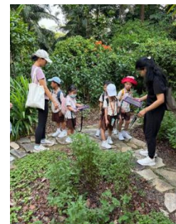
Using our iPads to take photos of plants.