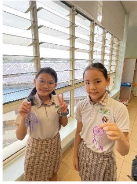
"This was so tough but we made it!"