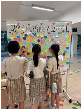
Students penned their Healthy Pledge & committed to stick to it

energised everyone for the new term's lessons and activities. Our students had an incredible time during the final SHINE Day of the year! It was a day filled with exciting opportunities to learn new skills, connect with peers, engage with teachers, and even interact with alumni.