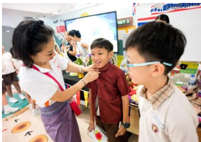
Trying out traditional Thai costume