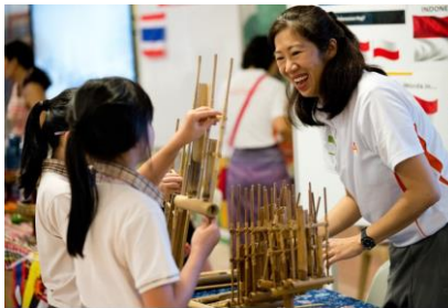
Students trying out Angklung

Each booth offered students a window into the country's traditions through hands-on activities, crafts, quizzes, costumes, and food-related games. From fruit carving and traditional dance to cultural quizzes and origami crafts, students had a fun-filled, eye-opening journey across the region. Those who visited at least four booths earned a sweet treat at the Snack Booth—a delicious way to celebrate their curiosity!