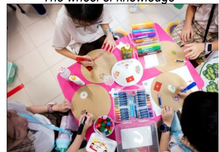
Designing their own nón lá (or leaf hat)

International Friendship Day at Henry Park Primary School was a vibrant reminder that while we come from different backgrounds, we are stronger together. A big thank you to our HPPA volunteers, teachers, and students for making this celebration truly unforgettable!