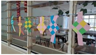
Colourful and vibrant classroom decorations

The Hari Raya celebration concert began with a highly entertaining and interactive skit titled "Hari Raya with Nek Eton", which brought laughter and meaningful messages to the audience. The concert concluded with a captivating performance by our school's Contemporary Dance CCA, leaving everyone in high spirits.