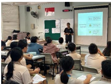
"I have got you covered!"

Through candid conversations, our alumni offered practical tips and valuable insights about the application process, including how they overcame challenges and achieved success. Their first-hand experiences proved especially relevant for our Primary 6 pupils who are preparing for their own DSA applications.