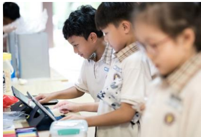
Exploring the digital kebaya game-ORKIDS TOWN!