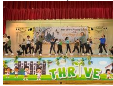
Where the elegance of traditional Malay cultural dance gets weaved into the bold expression of modern contemporary movement