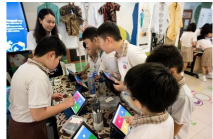
Kahoot game at the cultural booth