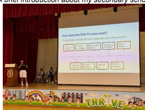
"Let me share the DSA process with you!"