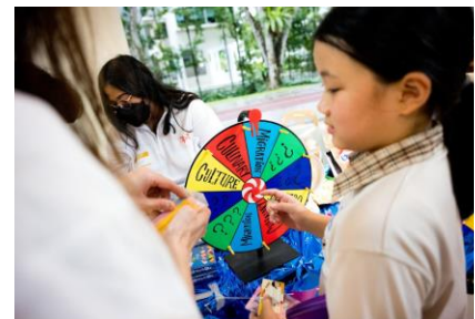
The wheel of knowledge