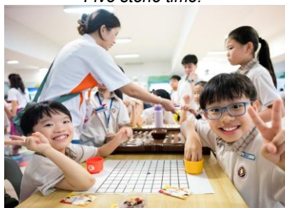
Game of Go!