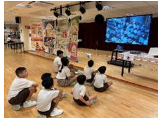
Students learning about Hari Raya Puasa at the School Library