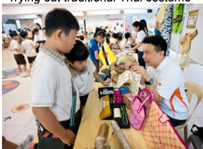
Eager learners for Brunei culture