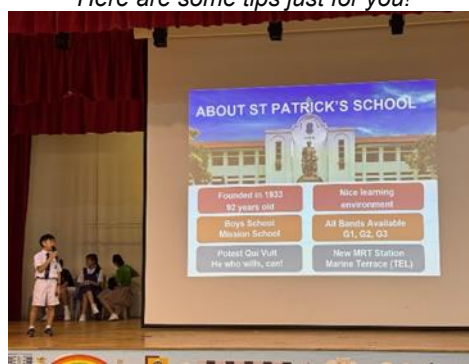
"A brief introduction about my secondary school."