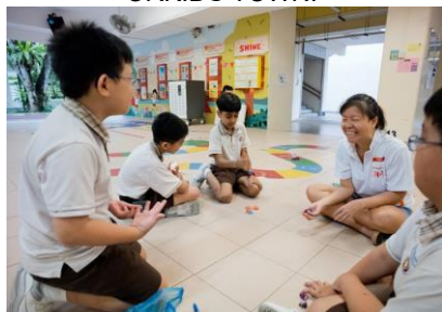
Five stone time!