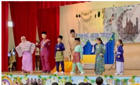
Staff and students got to don beautiful traditional Malay costumes during the skit