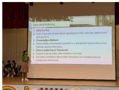
"Here are some tips just for you!"