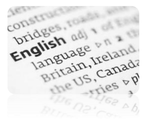
P3 English Language