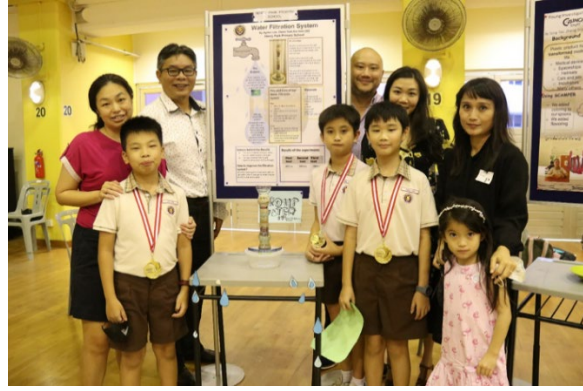
Our team from 5D was awarded the Elegant Project