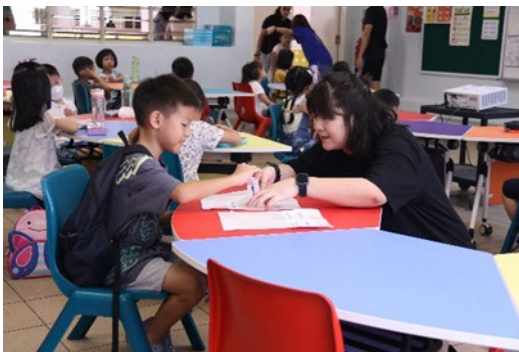
Welcoming P1 newcomers!

Running in parallel to the programme for the students, the parents gathered in the hall for a Parents' Engagement Session. Following this, they moved on to a Parents' Briefing led by the 2024 Primary 1 Form Teachers. This provided a valuable opportunity for parents to gain insights and receive practical tips, equipping them to support their children in the upcoming school year. The collaborative spirit between teachers and parents set a positive tone, emphasizing the importance of a united effort in nurturing the academic journey for the students.