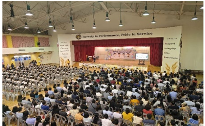
School hall filled with guests and prize-winners