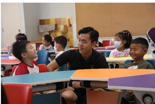
Getting to know their new teachers