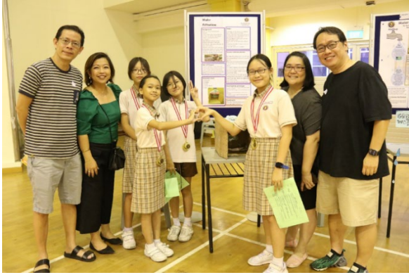
Our team from 5G was awarded the Green Award.