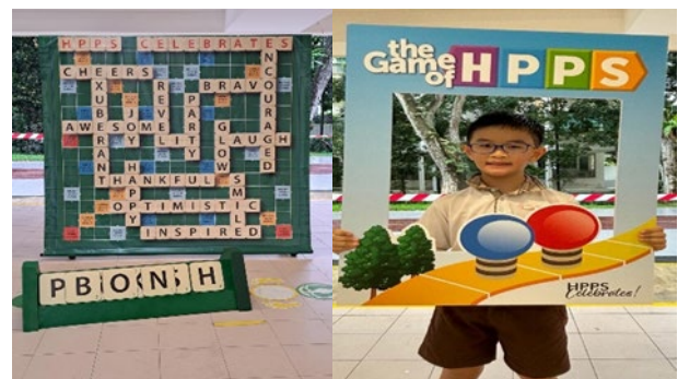
Our customised photo booths