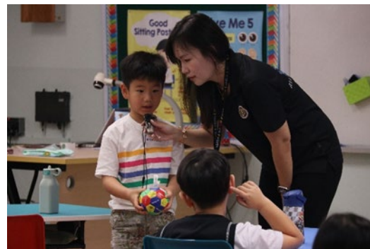
Introducing themselves to their new friends