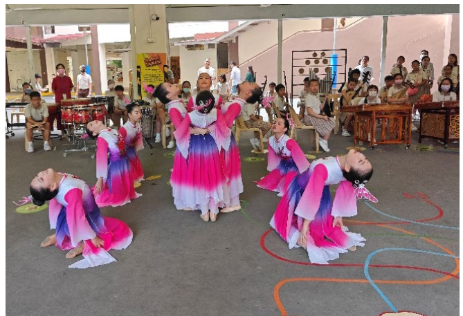
Up close and personal performance by Chinese Dance CCA