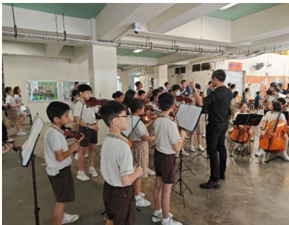
Up close and personal performance by String Ensemble CCA