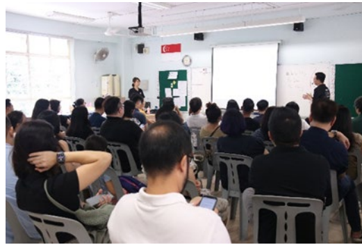
Briefing by the 2024 P1 form teachers