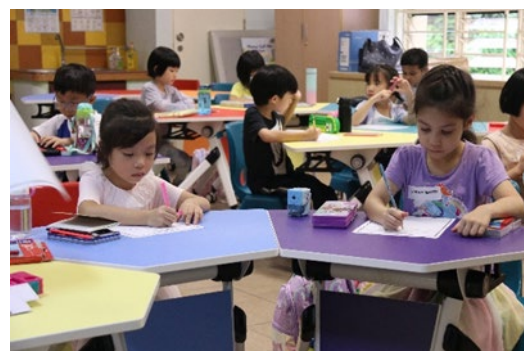
Immersing themselves in fun activities