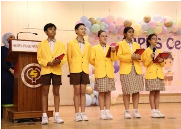
Our confident emcees!

Throwback to 16 Nov 2023. It was our inaugural HPPS Celebrates! (prize presentation ceremony). A memorable day where we celebrated the achievements and talents of our students. After the formal presentation ceremony, the celebratory mood continued as our guests were treated to up close and personal performances by our talented students. The atmosphere was informal and bubbly, as our guests also had the chance to interact with our VIPs, teachers, students and performers. The customised photo booths and props added a special touch for everyone to capture precious moments together as friends, families and colleagues. Thank you to all for celebrating with HPPS!